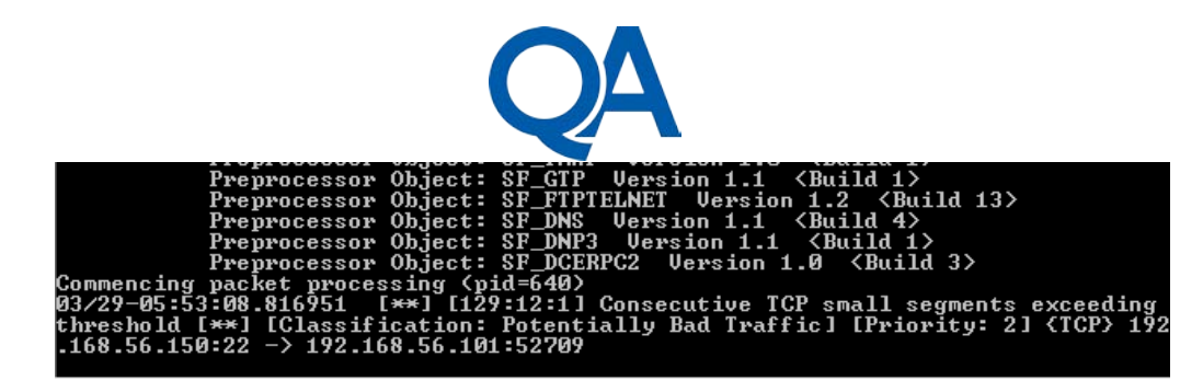
Figure 15: Snort Detection

When Snort detect a malicious packet, it saves a log file in binary PCAP format, which is possible to open with a software like Wireshark. Once opened it is possible to see full information on the detected packet as in Fig 16. The information carried by the packet is encrypted because it uses SSH protocol. However, since SSH is an application layer protocol, the remaining information in the other layers of the OSI model are not encrypted. It is possible to find out the attacker's IP address and potentially blacklist it. Furthermore, it is possible to use Snort as an Intrusion Prevention System (IPS) to block the detected packet before it can establish the SSH connection.